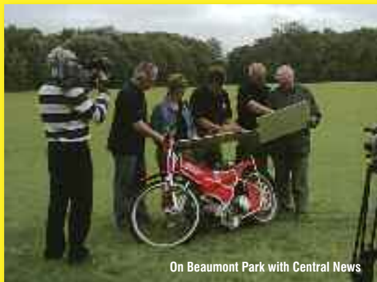
On Beaumont Park with Central News