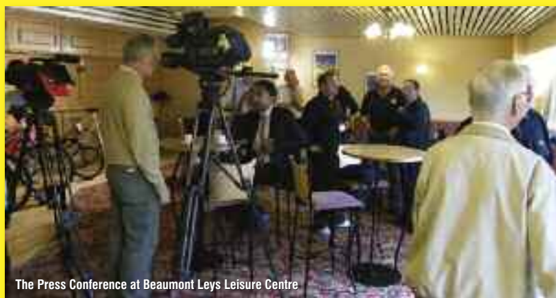
The Press Conference at Beaumont Leys Leisure Centre