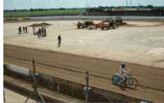
Whizzing past my daughter's seat in the stand!

A couple of younger lads on the course looked like they'd done it before and were really going for it. For my part I was just loving the sensation of riding a speedway bike on a speedway track and achieving the odd skid here and there. I should also mention how exhausting it is. When the day came to an end I was completely knackered!