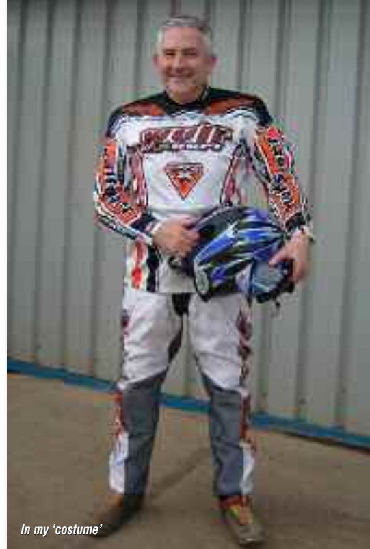
In my 'costume'

crazy enough to race one of these things, went off the scale. I learnt you have to keep the revs up to keep it going but as soon as I did that I was shooting towards the fence! I must have looked a bit jumpy on that first lap but as my confidence grew I absolutely loved it. On my second go I thought I'd 'step forward' as we'd been told. The first and second turns were the roughest so I waited until I was halfway around turns 3 and 4 before doing so, and giving the throttle a twist. And then it started... I was sliding the bike like a proper rider and coming off turn 4 into the straight at a decent speed with the back end skidding. Inside my helmet I had the biggest grin on my face ever - whilst at the same time trying to turn the handlebars so I didn't end up in the fence! Once I'd done 4 laps I was called in and got off the bike to watch the others before my next turn. Even though poor old Biker John fell off yet again, it was interesting to see that those of us in our 40's were much more concerned about self-preservation than doing anything crazy.